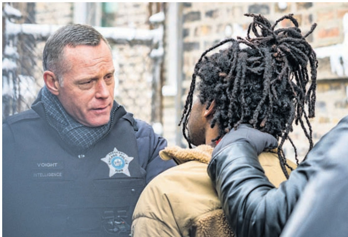
In this image released by NBC, Jason Beghe portrays Hank Voight, left, in a scene from the crime series "Chicago PD."

Protests have already changed television. "Cops," which for 33 seasons